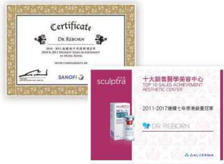
Sculptra — Highest Sales Achievement for Consecutive 7 Years from 2011 to 2017 within Hong Kong Sculptra — 2011–2017 連續 7 年全港銷量冠軍