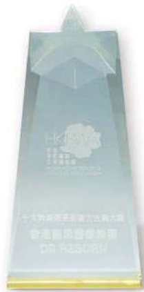
Hong Kong Beauty & Wellness Association — Top 10 Most Influential Brands of Beauty Industry 2017 香港美容專家及保健協會 — 2017年美容業十大最有影響力品牌