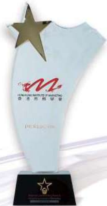
Hong Kong Institute of Marketing — Market Leadership Award 2017 香港市務學會 — 2017年市場領導獎