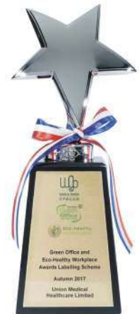
Green Office and Eco-Healthy Workplace Awards Labelling Scheme 世界綠色組織 — 2017年辦公室獎