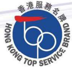
Hong Kong Top Service Brand 2017 2017年香港服務名牌