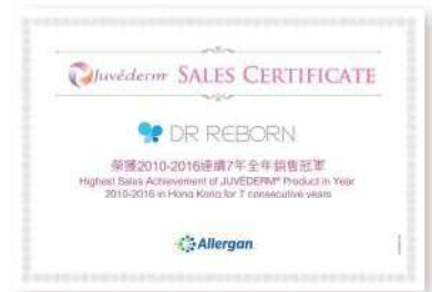
Juvederm — Highest Sales Achievement for Consecutive 7 Years from 2010 to 2016 within Hong Kong Juvederm — 2010–2016 連續 7 年全港銷售冠軍