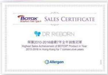
Botox — Highest Sales Achievement for Consecutive 7 Years from 2010 to 2016 within Hong Kong Botox — 2010–2016 連續 7 年全港銷售冠軍