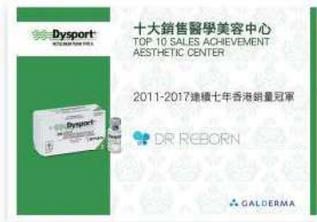
Dysport — Highest Sales Achievement for Consecutive 7 Years from 2011 to 2017 within Hong Kong Dysport — 2011–2017 連續 7 年全港銷量冠軍