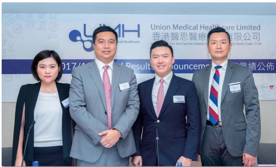
2017/18 Annual Results Announcement 2017/18年度業績公佈