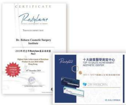
Restylane — Highest Sales Achievement for Consecutive 7 Years from 2011 to 2017 within Hong Kong Restylane — 2011–2017 連續 7 年全港銷量冠軍