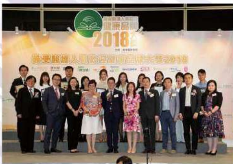
The Most Popular Medical Brands voted by Medical Staffs Award 2018 最受醫護人員歡迎品牌大獎 2018