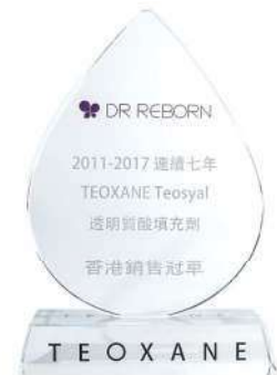
Teosyal — Highest Sales Achievement for Consecutive 7 Years from 2011 to 2017 within Hong Kong Teosyal — 2011–2017 連續 7 年全港銷量冠軍