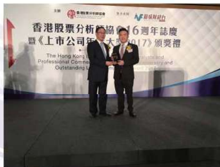
The Hong Kong Institute of Financial Analysts and Professional Commentators Limited 16th Anniversary — Outstanding Listed Companies Award 2017 香港股票分析協會 16週年誌慶暨上市公司 年度大獎 2017 頒獎禮