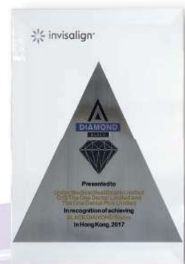
Black Diamond Status — 2017 Invisalign Advantage Program in Hong Kong 黑鑽供應商 — 2017 年香港隱適美優勢項目

Highest Sales Achievement for Consecutive 10 years within Hong Kong 高達連續 10 年 全港 銷量冠軍