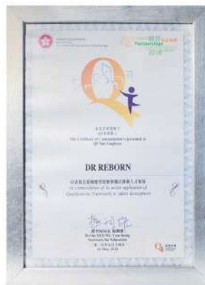
QF Partnerships Commendation Ceremony 2018 — QF Star Employer 資歷架構夥伴嘉許典禮 2018 — QF 星級僱主