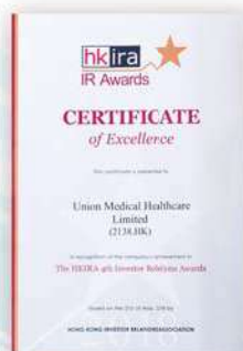
HKIRA 4th Investor Relations Awards — 第四屆香港投資者關係大獎