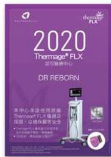
Soltamedical — Certificate of Authenticity Year 2020 for Thermage FLX Soltamedical — 2020年Thermage FLX認可醫療中心