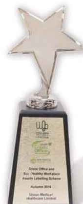
Green Office and Eco-Healthy Workplace Awards Labelling Scheme 世界綠色組織 — 2018 年辦公室獎