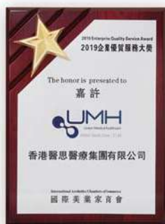
International Aesthetics Chambers of Commerce 2019 Enterprise Quality Service Award 國際美學業家商會 — 2019 年企業 優質服務大獎