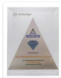
Diamond Status — 2019 Invisalign Advantage Program in Hong Kong 鑽石供應商 — 2019年香港隱適美優勢項目