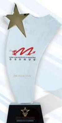
Hong Kong Institute of Marketing — Market Leadership Award 2018 香港市場學會 — 2018 年市場 領導獎