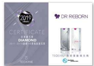
Teosyal — Highest Sales Achievement for Consecutive 9 Years from 2011 to 2019 within Hong Kong Teosyal — 2011–2019連續9年全港銷量冠軍