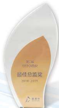
Road Show China The Best Investor Relations Director — 路演中國第二屆中國卓越 IR 最佳 總監獎