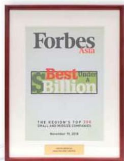
Forbes Asia Best Under A Billion The Region's Top 200 small and Midsize companies 2018 2018《福布斯》亞洲200強優秀 上市中小企業