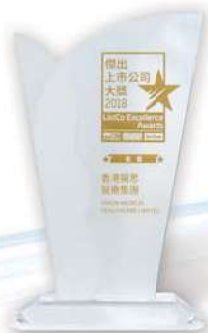
ListCo Excellence Awards 2018 2018 傑出上市公司大獎