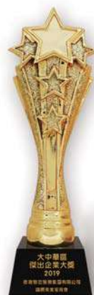
2019 International Aesthetics Chambers of Commerce 2019 Greater China Outstanding Enterprise Award 國際美學業家商會 — 2019 大中華區傑出企業大獎