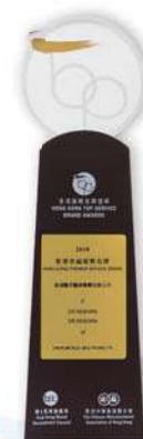
Hong Kong Premier Service Brand 2018 — 2018 香港卓越服務品牌