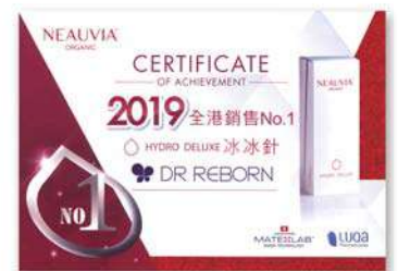
Hydro Deluxe — Highest Sales Achievement of Year 2019 within Hong Kong Hydro Deluxe — 2019年全港銷量冠軍