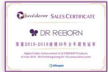
Juvederm — Highest Sales Achievement for Consecutive 10 Years from 2010 to 2019 within Hong Kong Juvederm — 2010–2019連續10年全港銷量冠軍