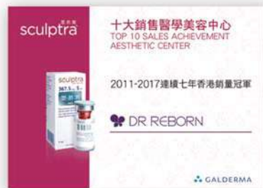
Sculptra — Highest Sales Achievement for Consecutive 7 Years from 2011 to 2017 within Hong Kong Sculptra — 2011–2017連續7年全港銷量冠軍