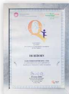
QF Partnerships Commendation Ceremony 2018 — QF Star Employer 資歷架構夥伴嘉許典禮 2018 — QF 星級僱主