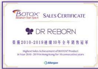
Botox — Highest Sales Achievement for Consecutive 10 Years from 2010 to 2019 within Hong Kong Botox — 2010–2019連續10年全港銷量冠軍