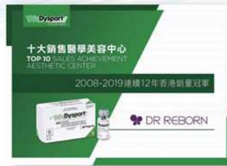
Dysport — Highest Sales Achievement for Consecutive 12 Years from 2008 to 2019 within Hong Kong Dysport — 2008–2019連續12年全港銷量冠軍