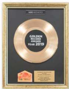
Merz Aesthetics — Golden Records Award Year 2019 for Ultherapy 香港正貨 — 2019年Ultherapy記錄金獎