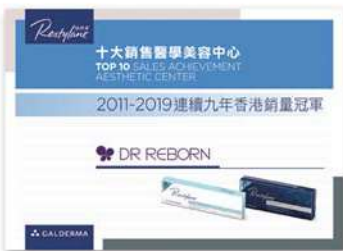
Restylane — Highest Sales Achievement for Consecutive 9 Years from 2011 to 2019 within Hong Kong Restylane — 2011–2019連續9年全港銷量冠軍